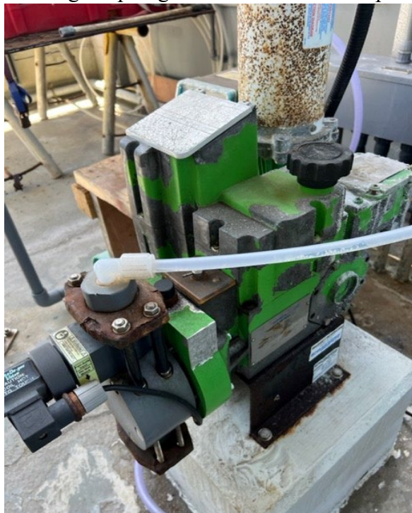
Existing Diaphragm Chemical Feed Pump