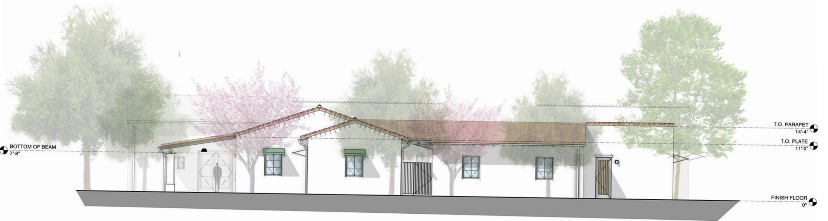
4 SOUTH ELEVATION SCALE: 1/8" = 1'-0"