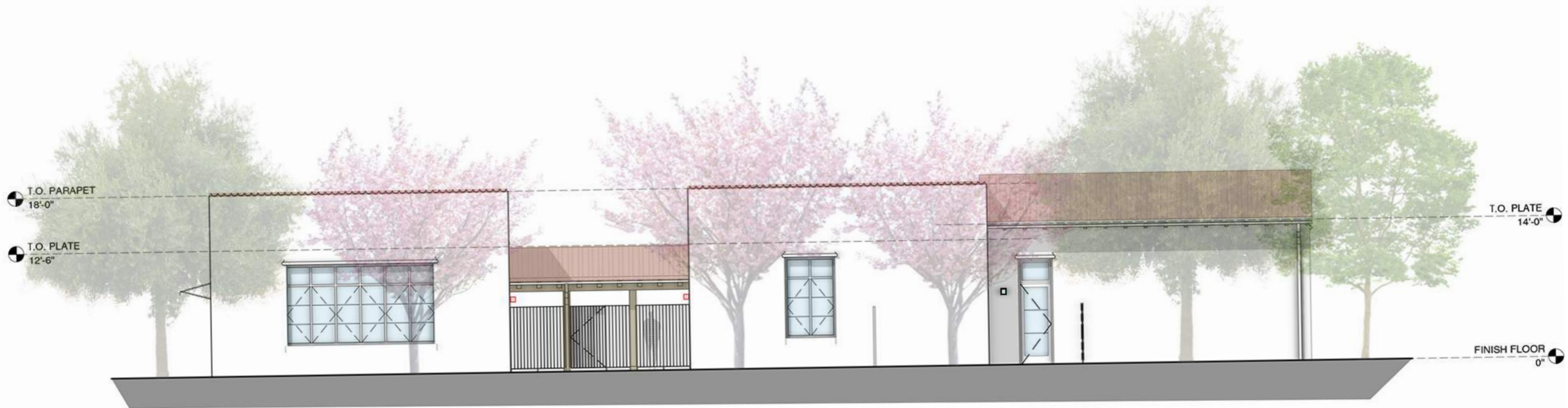
2 NORTH ELEVATION SCALE: 1/8" = 1'-0"