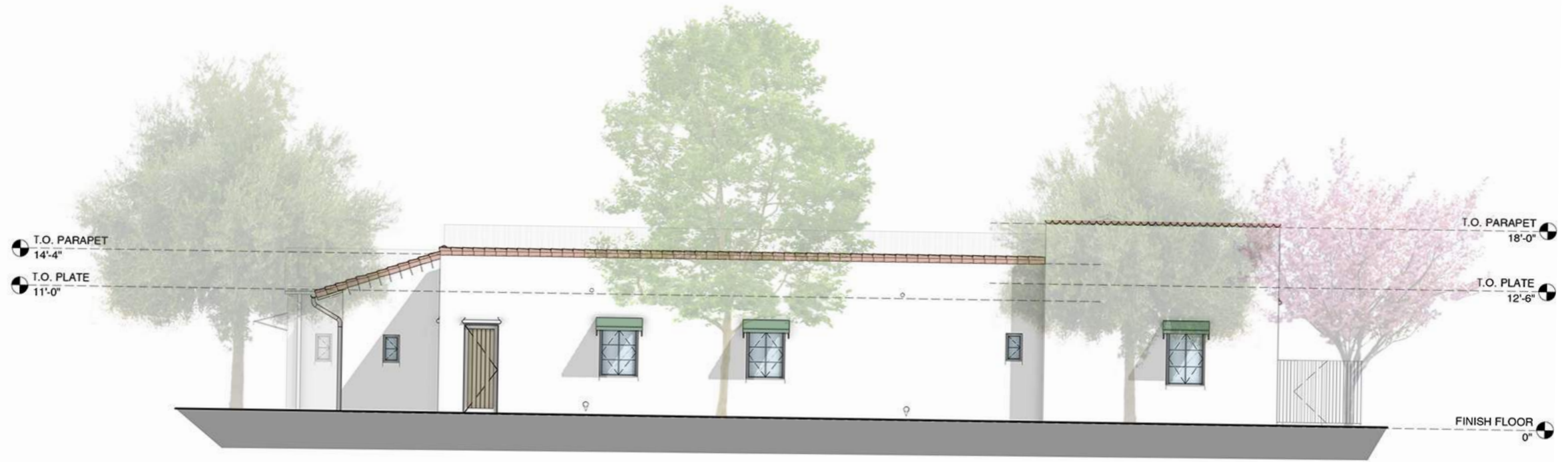
3 EAST ELEVATION SCALE: 1/8" = 1'-0"