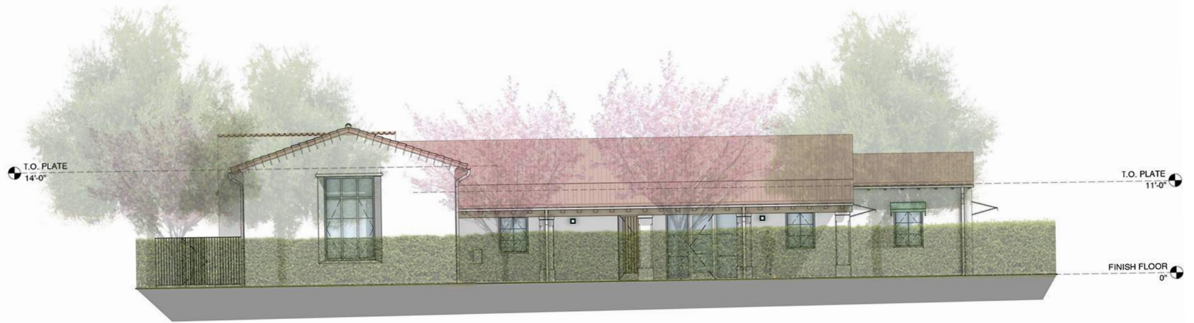
1 WEST ELEVATION SCALE: 1/8" = 1'-0"